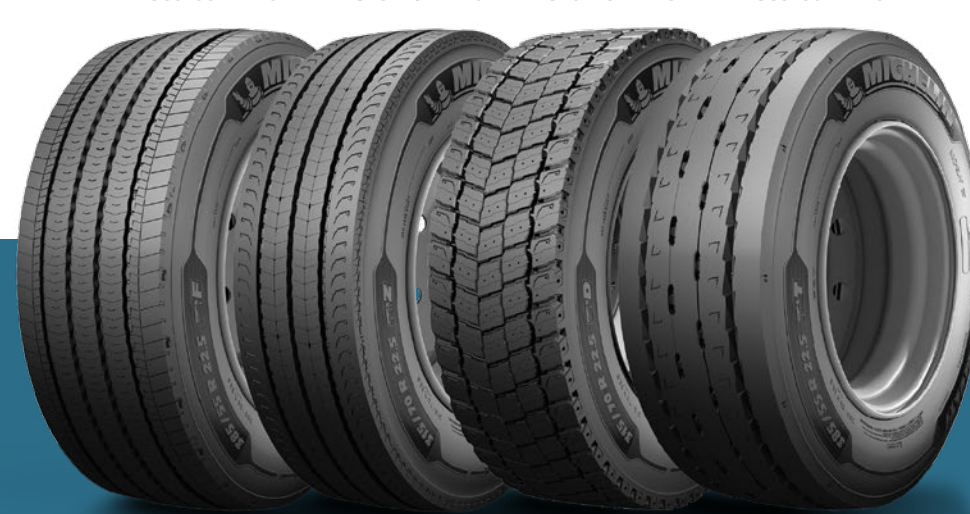
MICHELIN X ® MULTI ™ T2 385/55 R 22.5