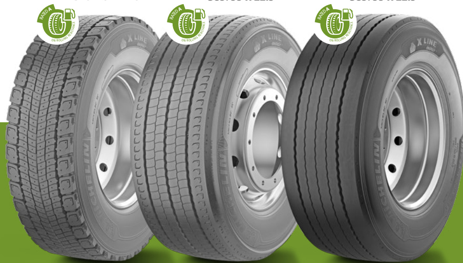
MICHELIN X ® LINE ™ ENERGY ™ T 385/55 R 22.5