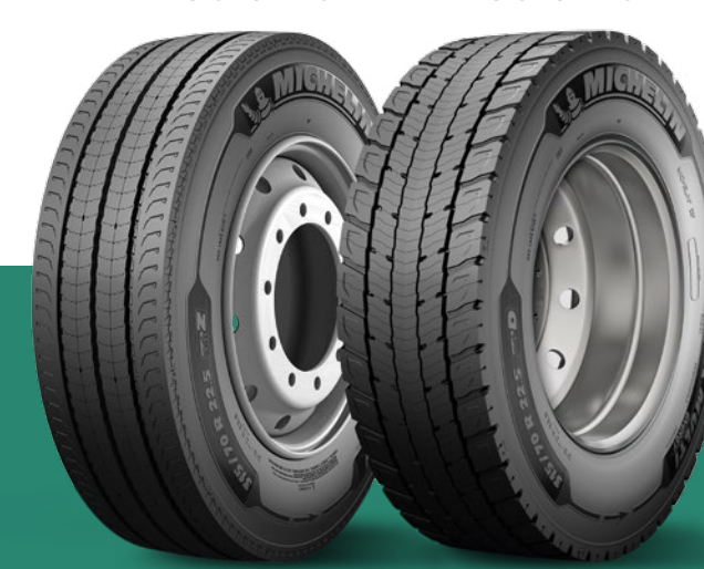
MICHELIN X ® MULTI ™ ENERGY ™ D 315/70 R 22.5